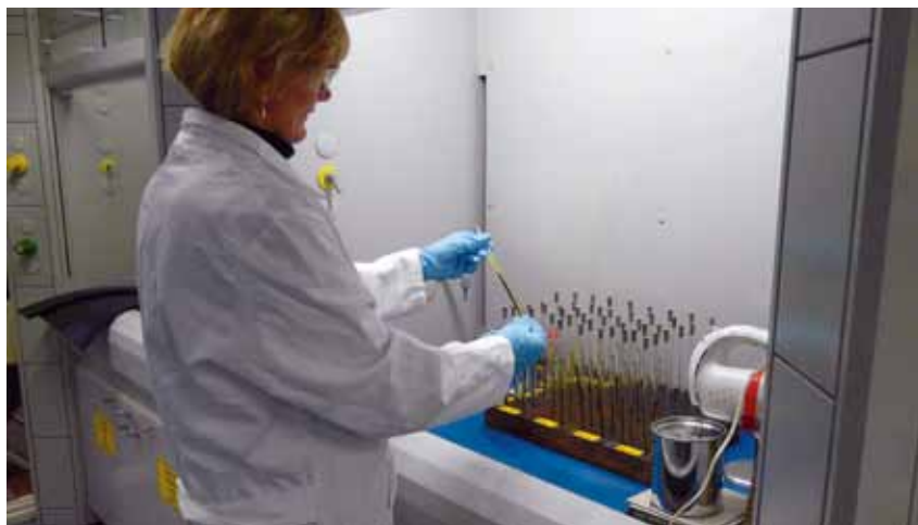
Mad science: creating the next generation conveyor belts.

Thanks to the developments that take place in the laboratory, Dunlop is creating a new generation conveyor belts that are increasingly able to withstand just about anything that can be thrown at them. From highly abrasive, razor sharp materials to ozone pollution and extremes of heat cold, Dunlop belts can handle it because the wizards of the laboratory make sure they can. But simply maintaining the company's reputation for producing the best conveyor belts in the world is only part of the story.